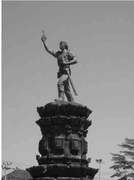
Figure 2: Revolutionary Hero, Denpasar

Urban anthropologists have speculated that this depiction of the sacrifice of national heroes during the independence struggle could be linked to ancestor worship, or to the world axis ( paku alam ) of Hindu-Javanese mythology (Nas 1993). A more far-fetched argument might suggest a connection to the sacrifice of a slave under the town pillar ( lak muang ) in Bangkok through which the city was established and safeguarded against otherworldly attacks.