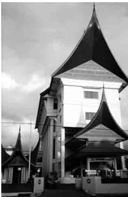
Figure 5: Bank Building, Padang, West Sumatra

It was further reported that the fountain uses German technology and features fourteen different songs of mainly Betawi origin, like Kopi Dandut , Lenggak-lenggok Jakarta and Ampar-ampar Pisang – rather than the national anthem, Padamu Negeri or other nationalist songs. Betawi songs, German technology, American-style fountain together symbolise the global city with a local touch, as opposed to the national capital of a struggling postcolonial nation.