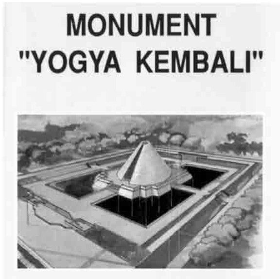
Figure 4: Monument “Yogya Kembali”, Yogyakarta

modernity and localism created “hybrid space” in many urban areas of Indonesia and elsewhere in Southeast Asia. The Malay Middle Eastern symbolism of the new administrative capital of Putrajaya located in the modern Multimedia Super Corridor of Malaysia’s emerging knowledge society provides a vivid example of this trend (Boey 2002; Menkhoff/ Evers/ Chay 2005).