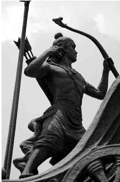
Figure 3: Arjuna Monument, Jakarta

prominent place in the museum, which in turn is locally interpreted as a modern version of mount Meru, the global mountain of Hindu-Javanese mythology, surrounded by the oceans in the guise of several ponds. Furthermore the museum building is aligned with the mythical volcano Merapi, the tugu (end of the ritual road of procession) and the palace of the Sultan of Yogyakarta (see Nas/Sluis 2002). After all, Yogyakarta was the first short-lived capital of independent Indonesia and is, like Jakarta, a “special region” ( daerah istimewa ).