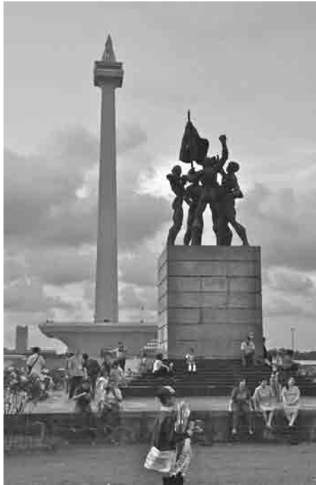
Figure 1: National Monument, Jakarta

new capital, Sukarno and his political elite opted for a “theatre state” 1 solution, building what Peter Nas (1993) has called a “city full of symbols”. As Abeyasekere puts it in her history of Jakarta, the Sukarno government was good at symbolism but rather poor at providing the facilities necessary to run a world class city (Abeyasekere 1987).